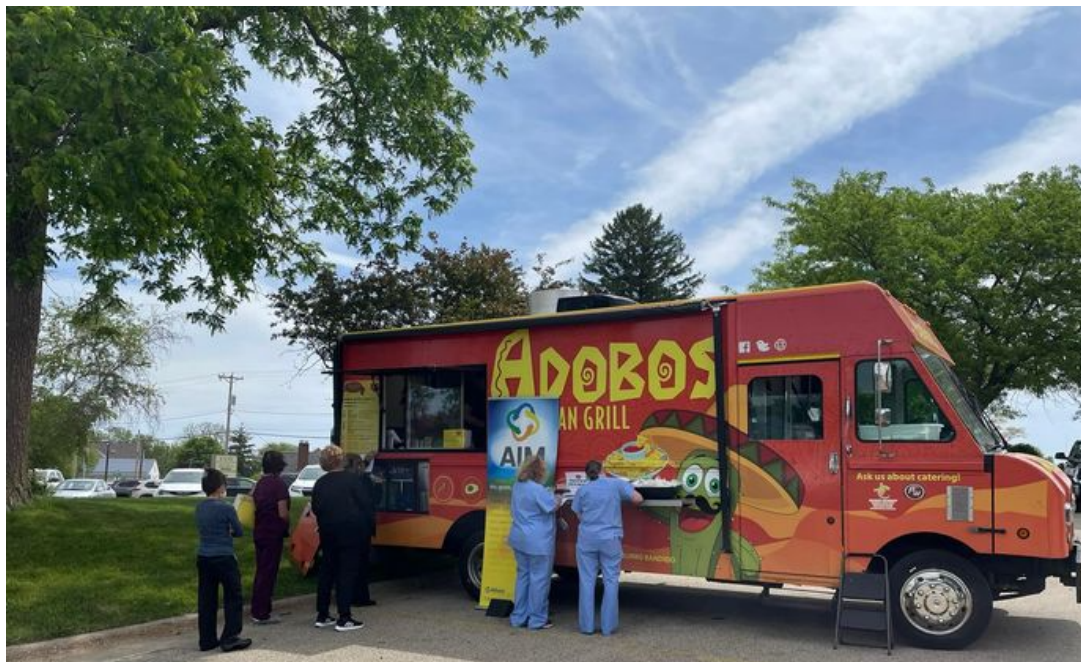
June 1, 2022 – Medical workers begin to line up for Adobos food truck at Grand River Medical Group in Dubuque. Nearly 130 GRMG team members took advantage of the offer from AIM on a picture perfect spring day!