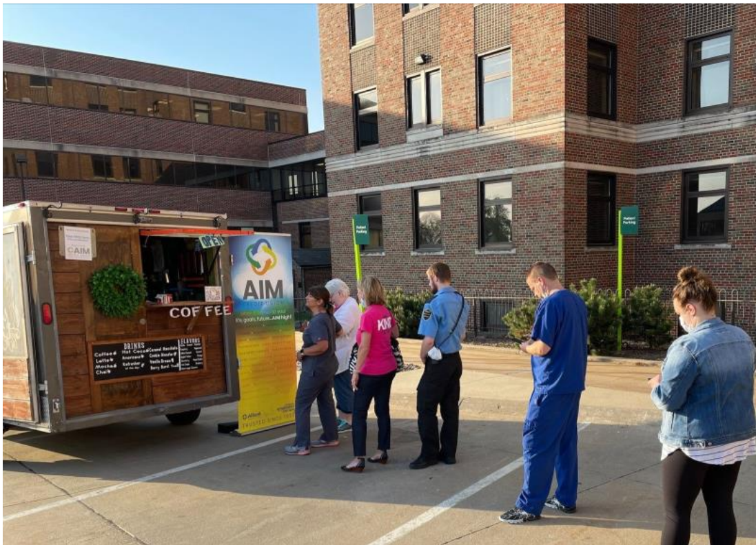
May 13, 2022 – Over 300 healthcare workers lined up throughout the morning to receive a free drink from the "That One Place Bean" coffee trailer. AIM Credit Union sponsored the trailer's arrival and provided the free drinks to support all the hardworking staff at MercyOne Dubuque Medical Center during Hospital Week.